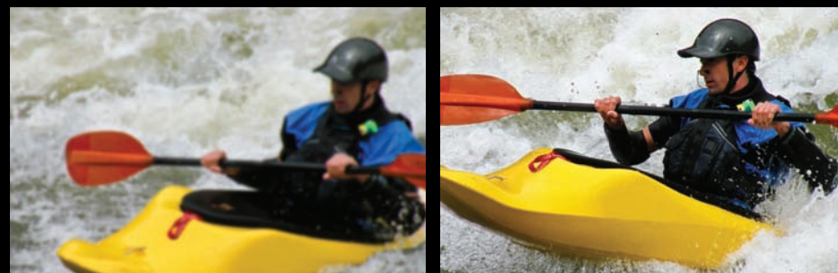
without vibration reduction