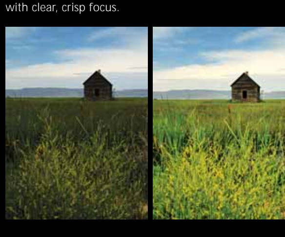
Compensates for underexposed images or insufficient flash by automatically adding light and detail to selected shots where needed, without affecting properly exposed areas.