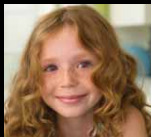
In-Camera Red-Eye Fix™ This in-camera feature automatically fixes most typical