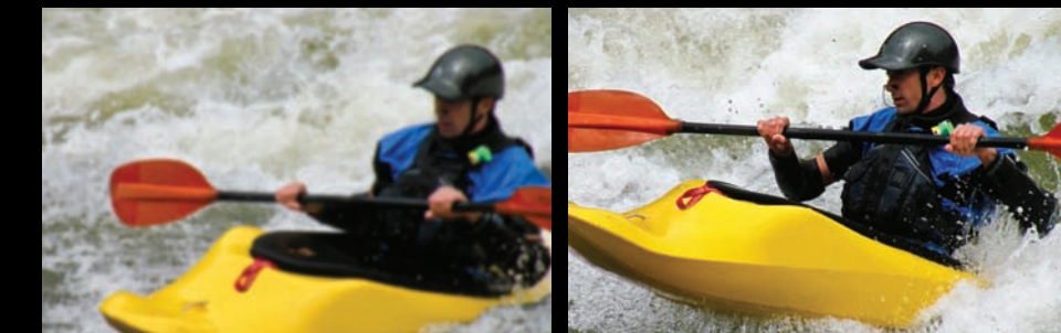
without vibration reduction