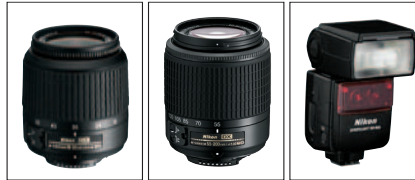
New AF-S DX Zoom-Nikkor 18-55mm f/3.5-5.6G ED New AF-S DX Zoom-Nikkor 55-200mm f/4-5.6G ED Speedlight SB-600

Support for Nikon's Total Imaging System includes compatibility with a wide variety of high-quality Nikkor lenses and the Speedlights SB-800 or SB-600 of Nikon's Creative Lighting System.