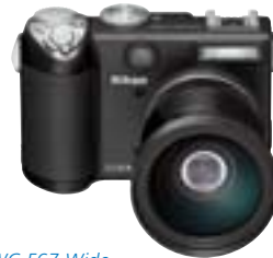
WC-E67 Wide Angle Adapter (optional) (requires UR-E20)