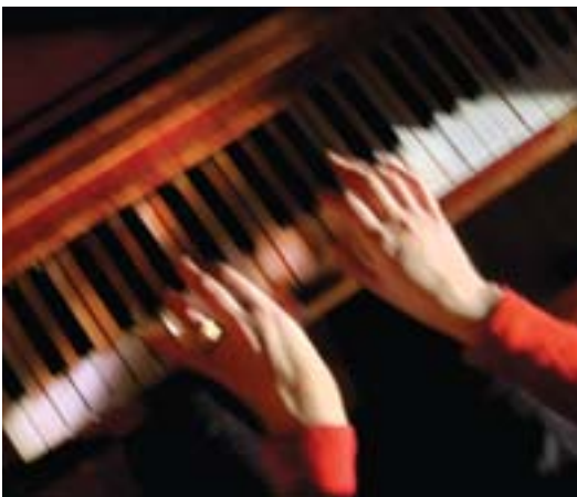
without vibration reduction