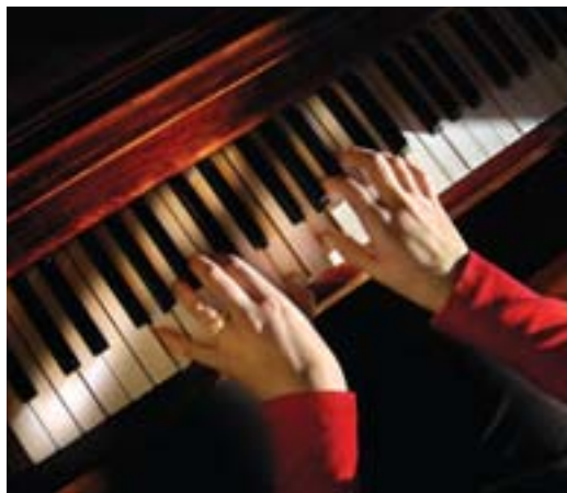
with vibration reduction