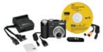
Included: Neck Strap, USB Cable, Audio Video Cable, Li-ion Rechargeable Battery EN-EL5, Battery Charger MH-61, PictureProject™ CD-Rom