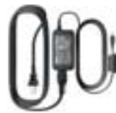
AC Adapter EH-62A (optional)