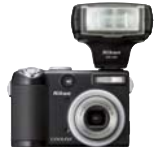
SB-400 Speedlight (optional)