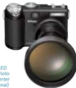
TCE-3ED Telephoto Converter (optional) (requires UR-E20)