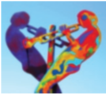
without vibration reduction