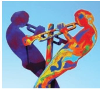
with vibration reduction

Make camera shake a thing of the past. Incorporating highly effective VR Optical Image Stabilization into its slim, compact dimensions, the COOLPIX L15 produces sharper, more satisfactory shots.